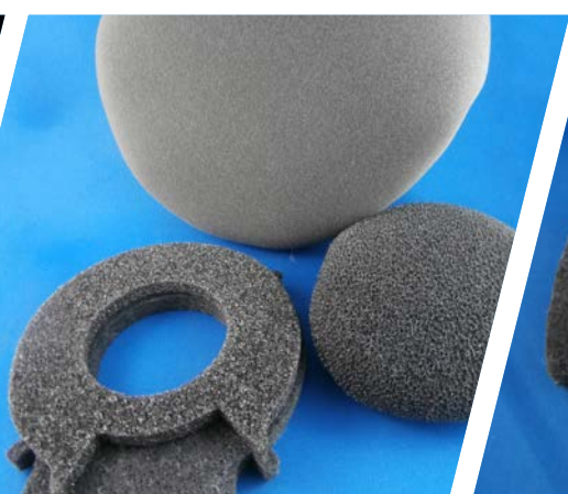
Carbon filter pack, comes as a pair $55.90